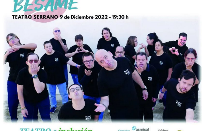
TEATRO e inclusión TALLER DE TEATRO ESPAI D'ART asmisai

Cooking/handicraft workshops: a group of residents, together with an assistant, go shopping for what is needed to carry out the programmed activity, cooking or any other type of handicraft.